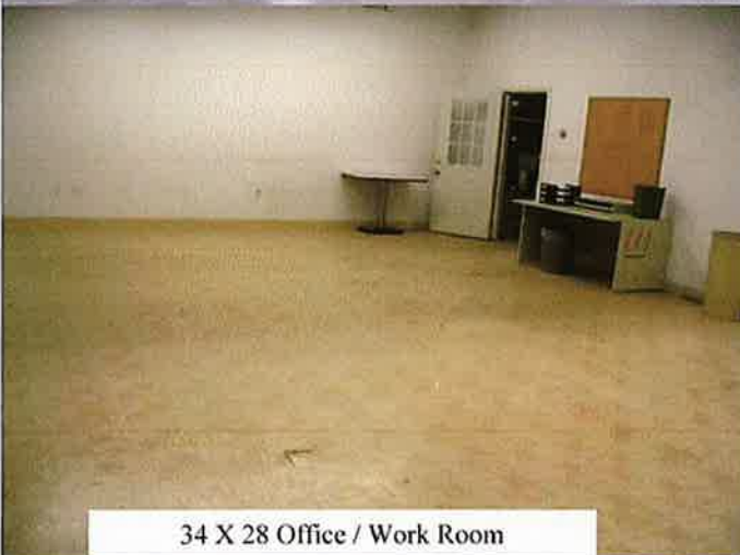
34 X 28 Office / Work Room