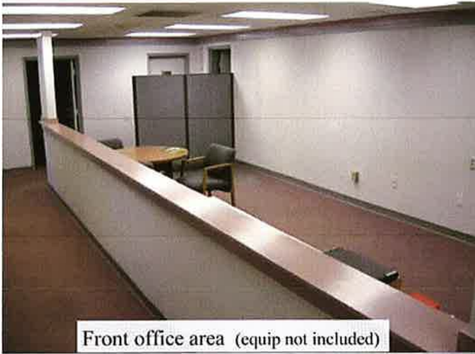
Front office area (equip not included)