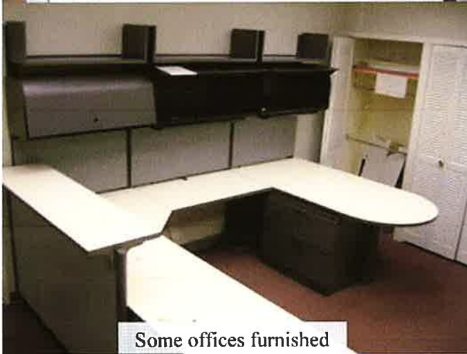
Some offices furnished