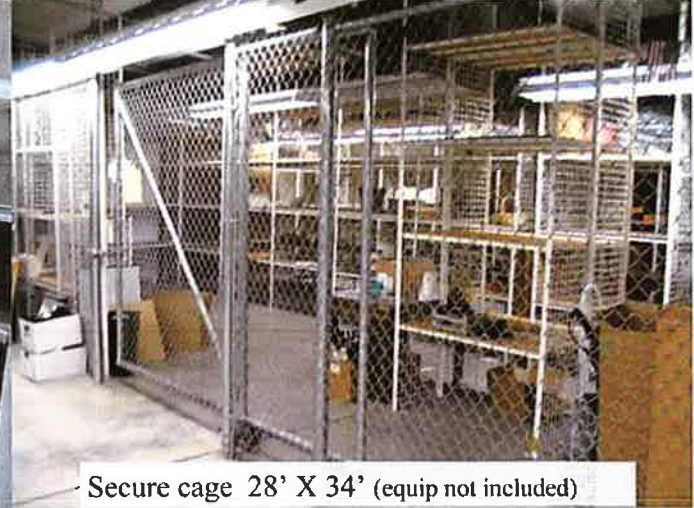
Secure cage 28' X 34' (equip not included)