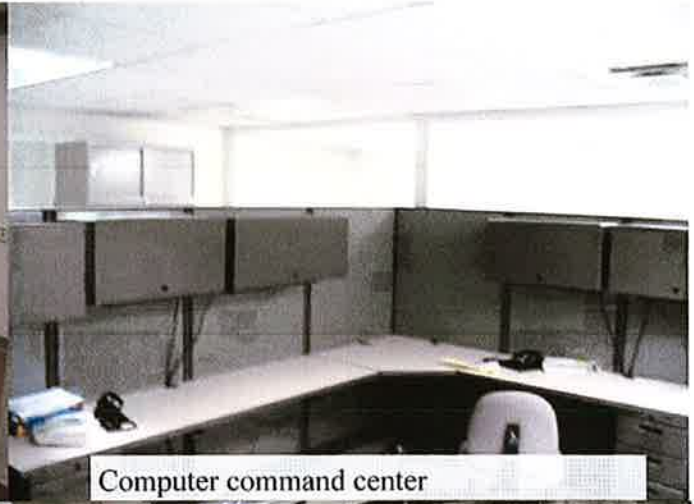
Computer command center