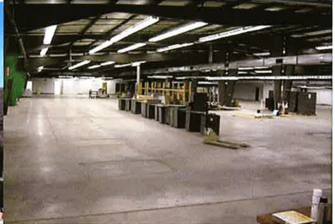
Large warehouse space.